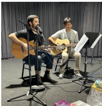
Performing at Cancer Fundraiser

Thanks again and God bless you all. I hope to see you again soon.