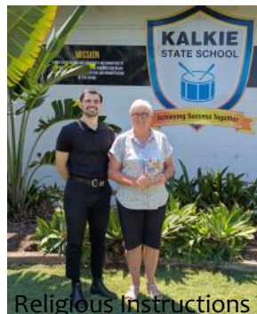
in State Schools