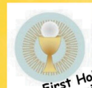
First Holy Communion