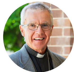
Bishop Danny Meagher

If you wish to make a donation, please scan the QR code and follow the prompts.